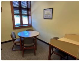
Study Room 2